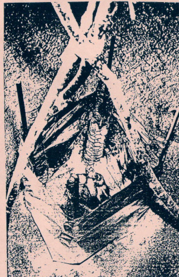
Fig. 85. Tripod centered over stakes suspending chicken

At the 1984 SHAC Scout Fair, Boy Scout Troop 1332, Polaris District, first introduced the use of the "Free Heat Vertical Spit." The plans and method* required modification, however, in order to "Roast Turkeys."