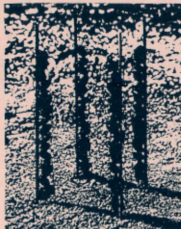
Fig. 83. Briquets in wire cages

It will take about an hour to an hour and a half to roast the chicken. When you baste the chicken with barbecue sauce, do it the last 15 minutes, or the sauce will burn.